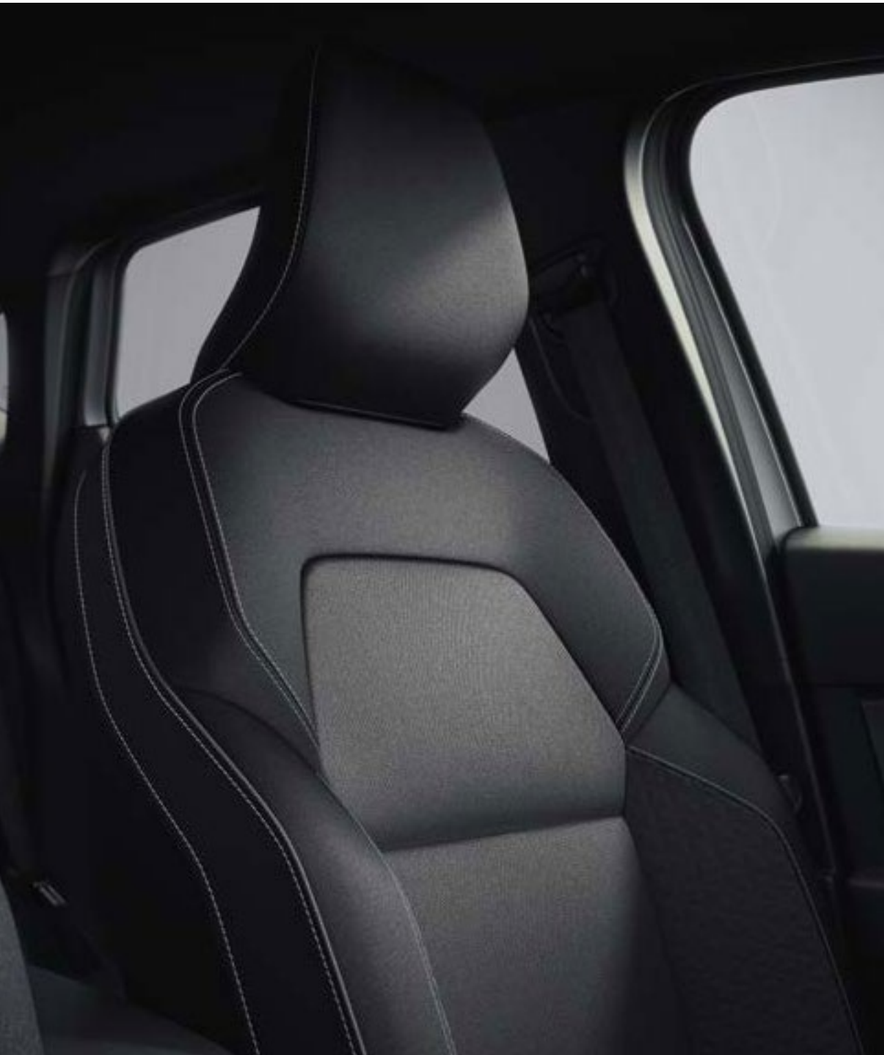
embossed mottled grey assault fabric / black kario fabric with drake blue top-stitching