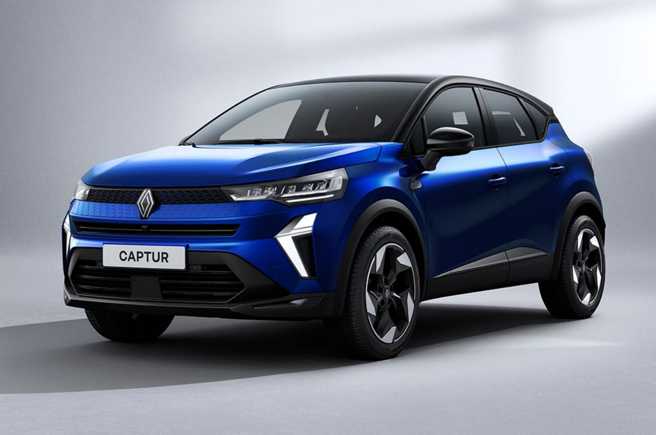
iron blue (mp)