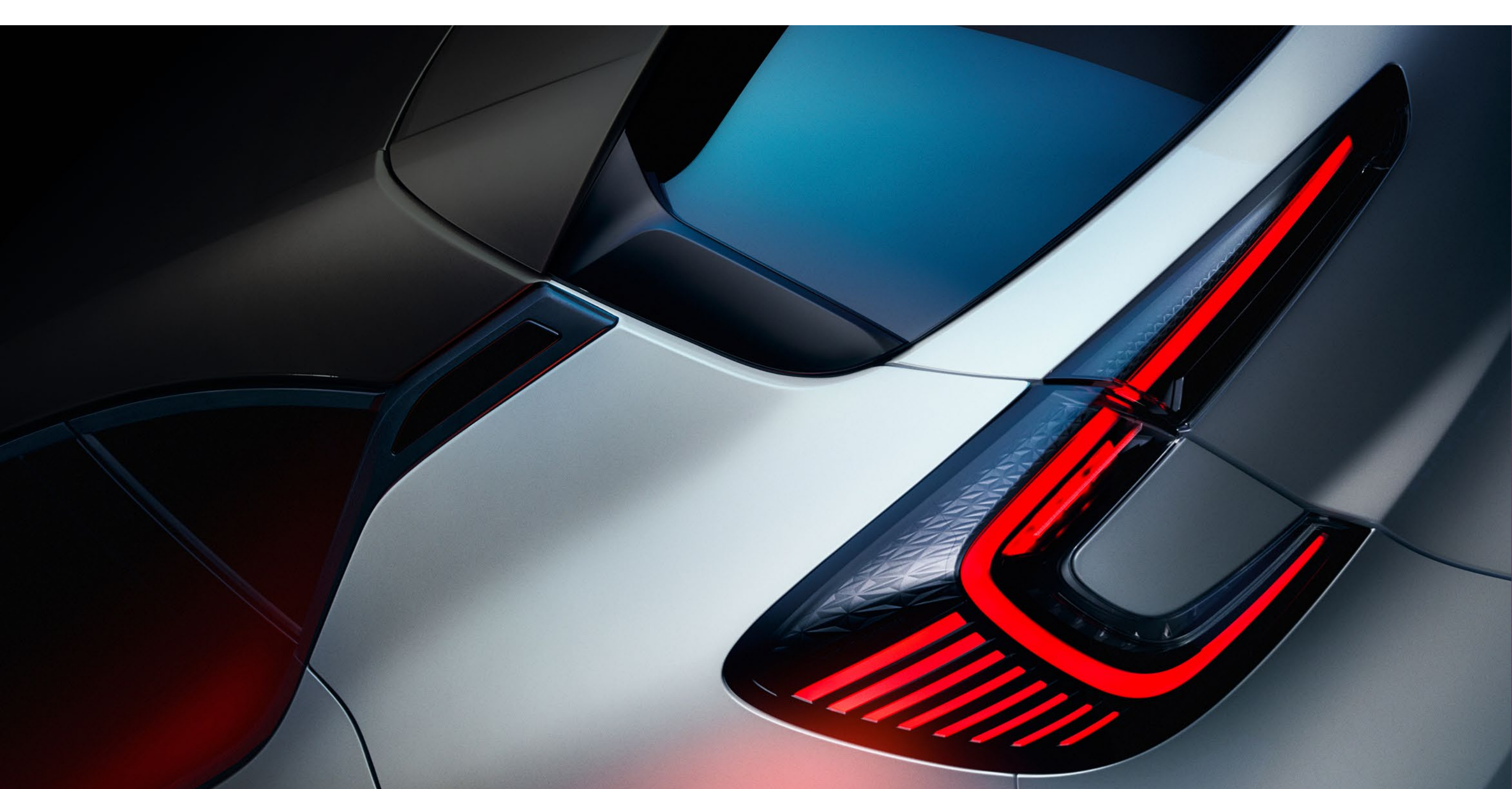
arctic white highland pearl black roof

Rediscover Captur's DNA with its timeless two-tone touch. The piano black roof colour enhances the possible combinations.