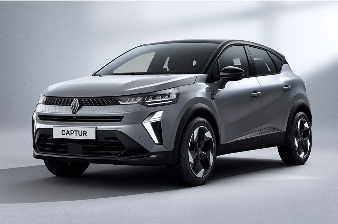
urban grey (mp)