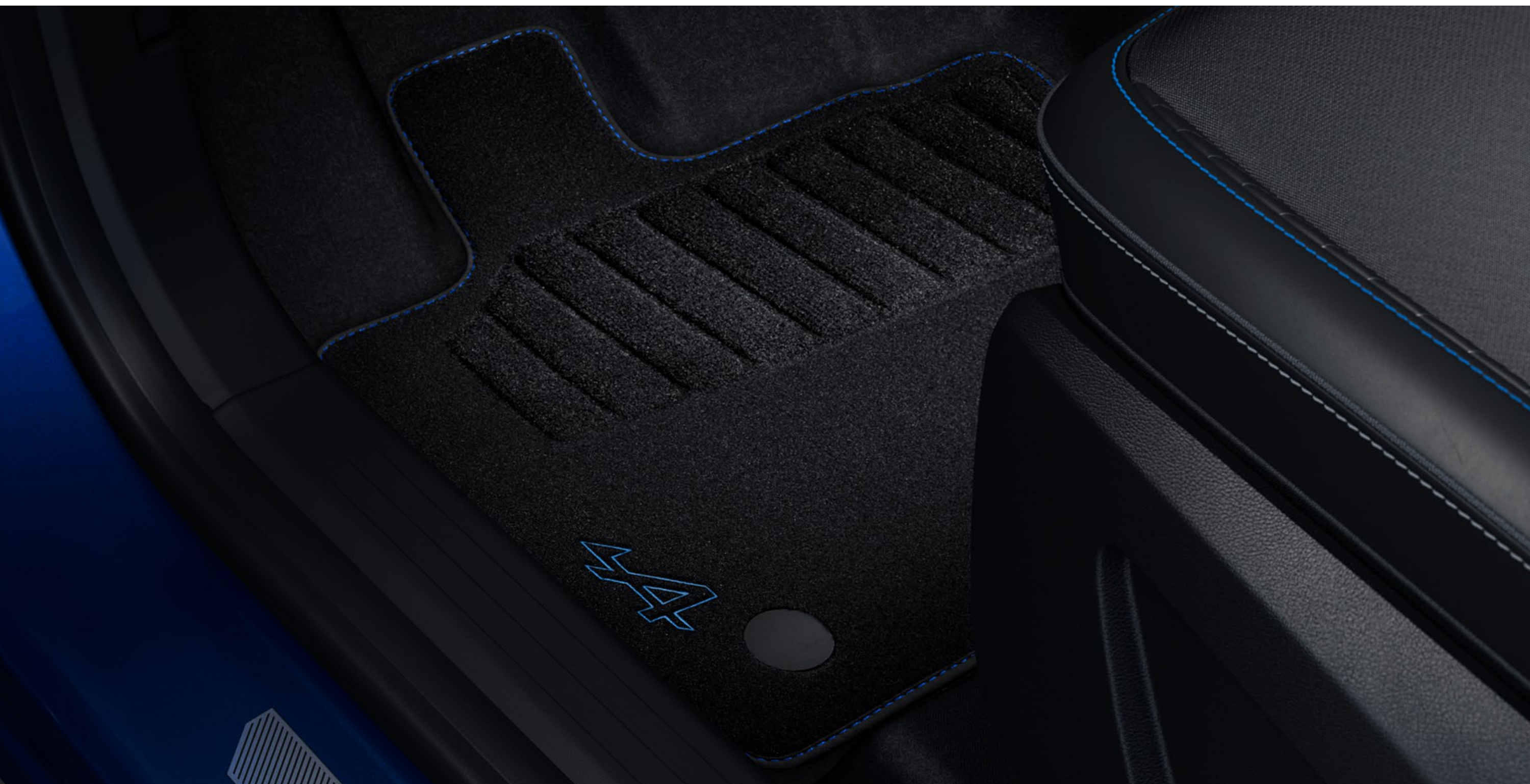
esprit Alpine floor mats The premium quality extends to the front and rear mats with blue stitching that adds a touch of sophistication. The distinctive signature features the Alpine logo on the front mats.