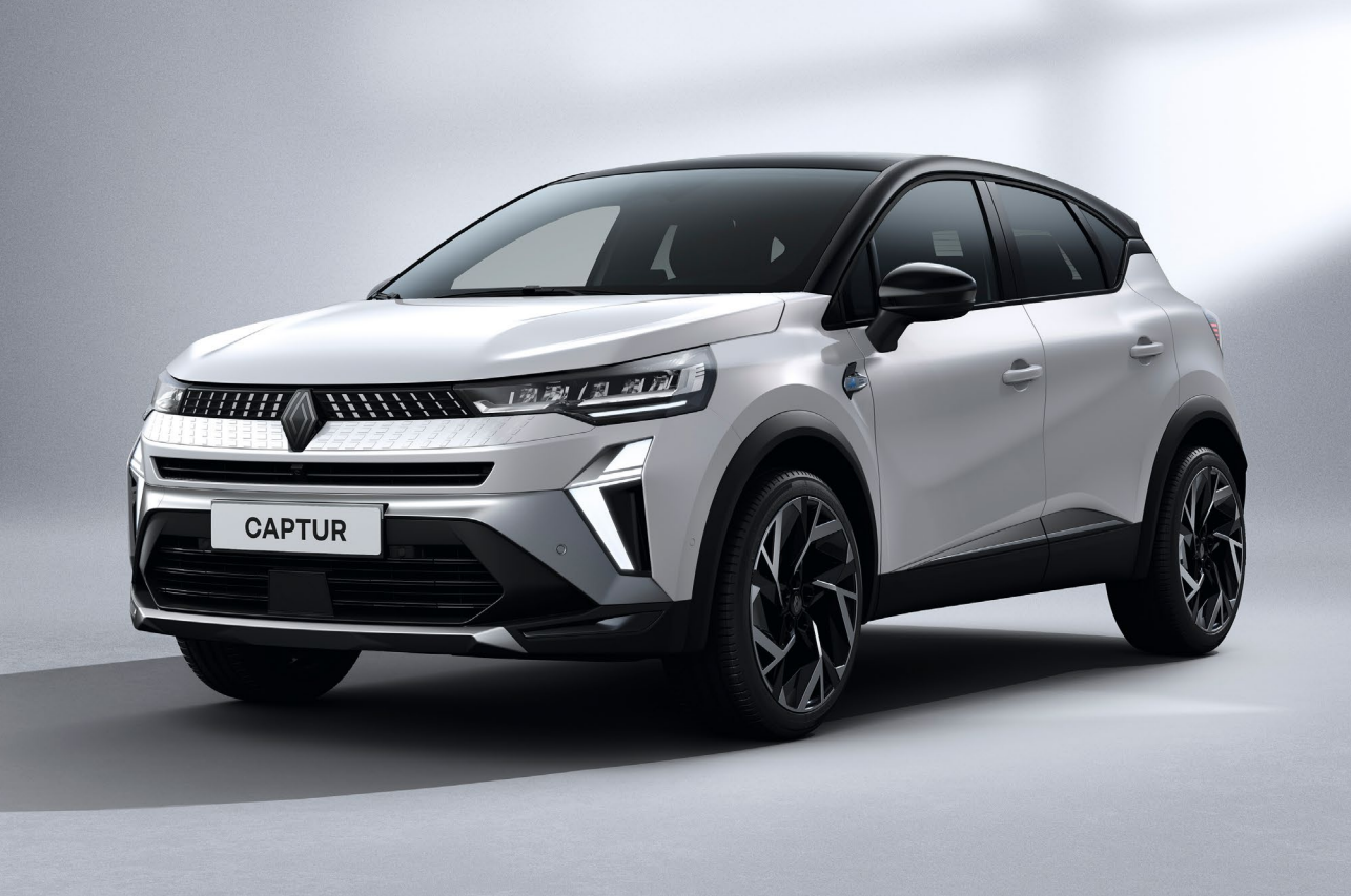
arctic white (p)