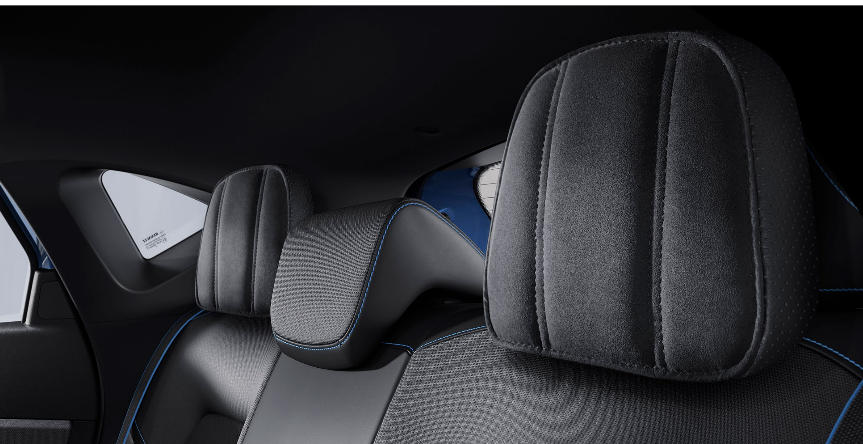
high-comfort black cushions on rear headrests For first-class travel, opt for the rear headrest cushion, which adds style and a feeling of well-being.