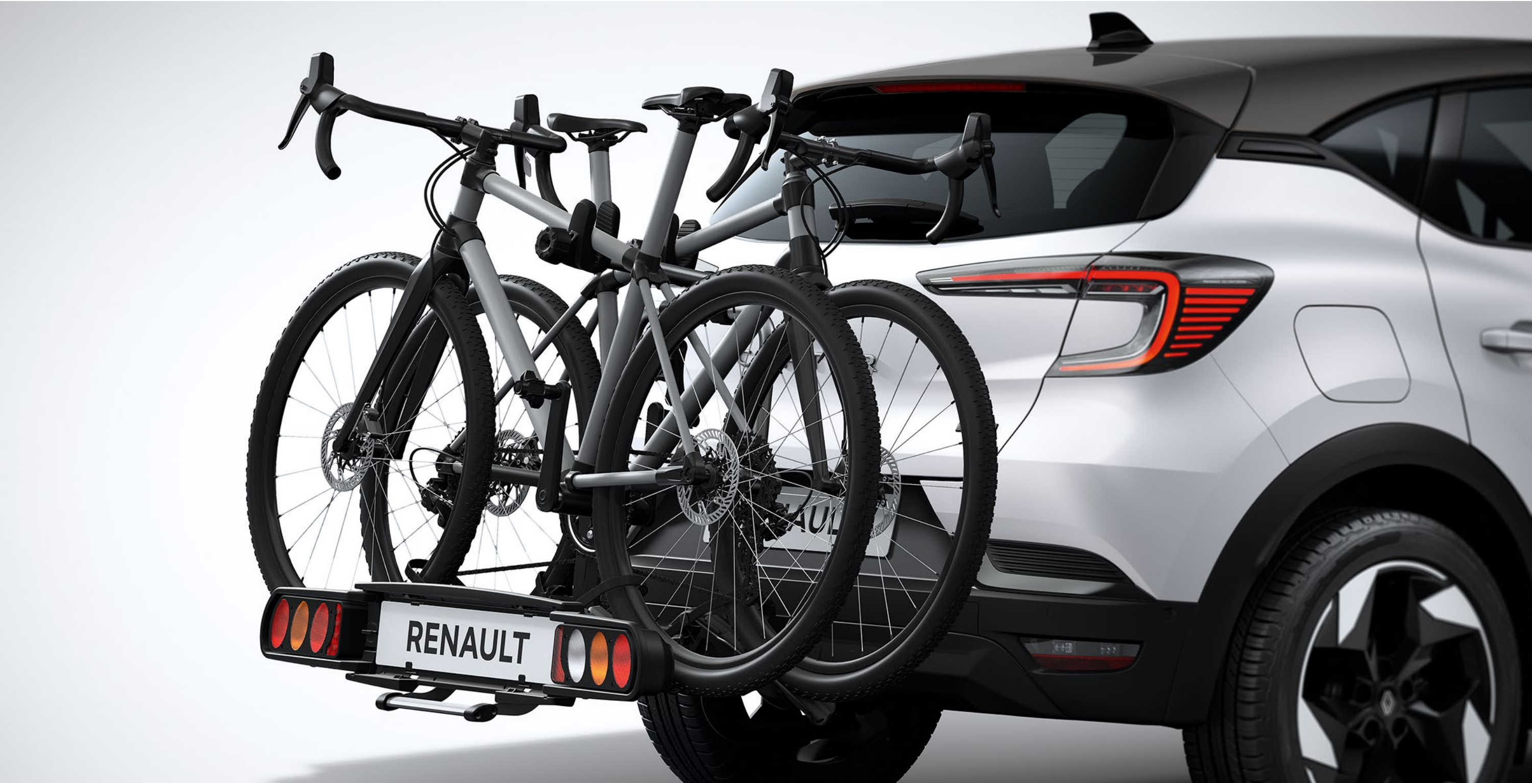
retractable towbar With Renault's innovative electric-towing system, you can tow a trailer or carry bikes with minimum fuss.