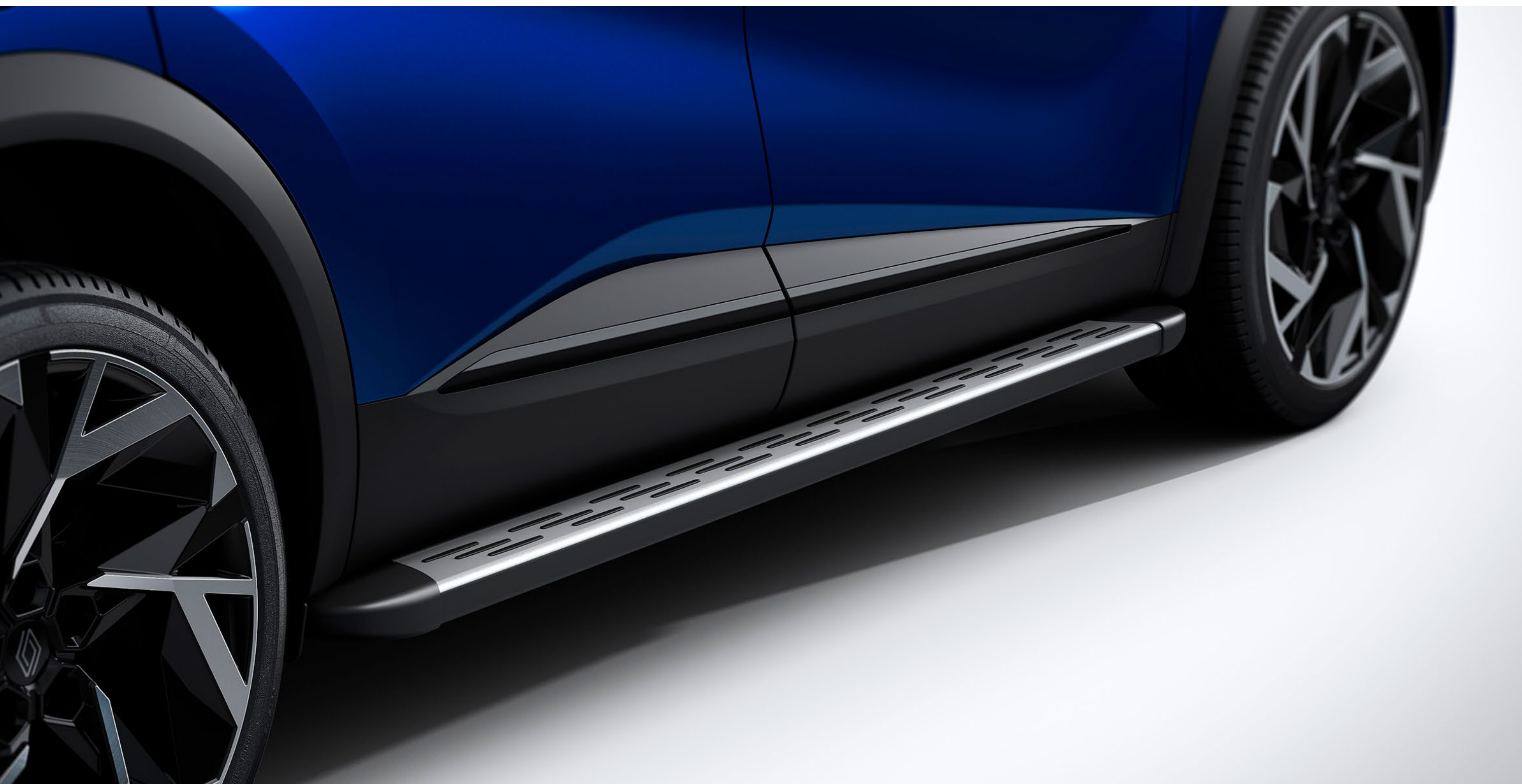
premium sidesteps Emphasise the car's SUV design and also allow easy access to the roof load.