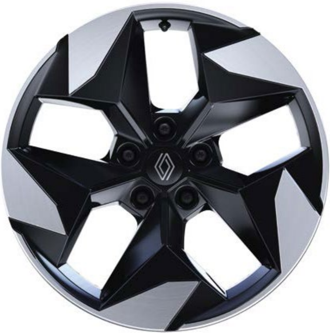
18" black hole alloy wheels

embossed marled black faunny fabric / marled black mellow fabric / titanium black refined textile with fresh yellow top-stitching