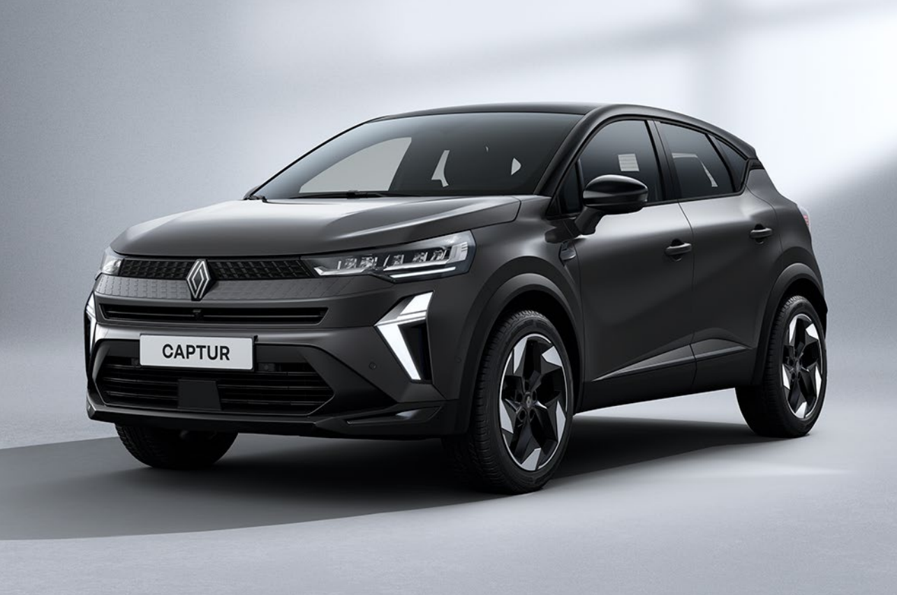
oyster grey (mp)

p: pearlescent mp: metallic paint. photos not contractually binding.