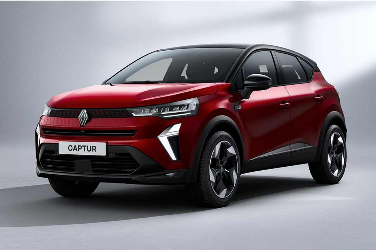
passion red (mp)